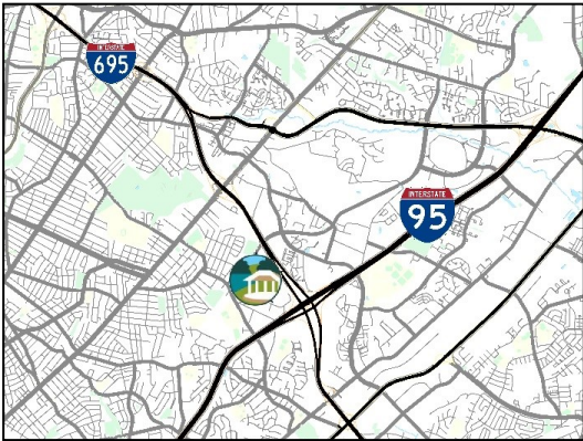
Holt Park is located near Kenwood Avenue.